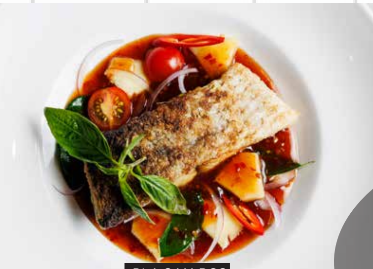
PLA SAM ROS