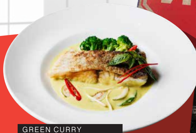
GREEN CURRY BARRAMUNDI FILLET