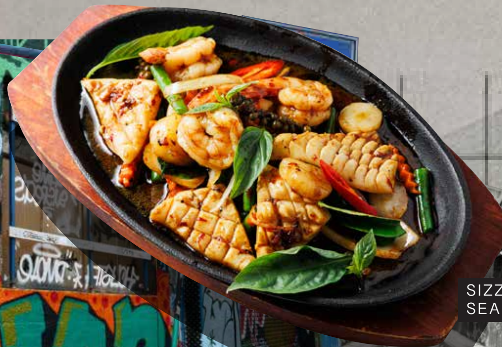
SIZZLING PAD CHA SEAFOOD