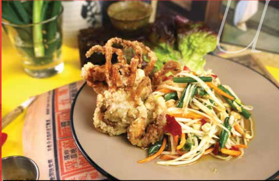
PAPAYA SALAD WITH SOFT SHELL CRAB 25.9

Green papaya salad with soft shell crab, peanuts and chilli