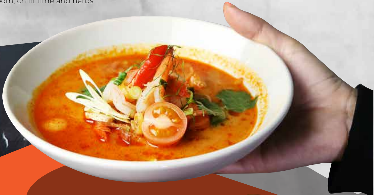
CREAMY TOM YUM PRAWN

TOM KHA GAI 16.9 Chicken soup with coconut milk, galangal, oyster mushroom, chilli, lime and herbs