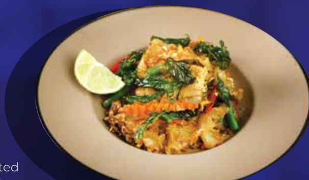
PAD KEE MAO