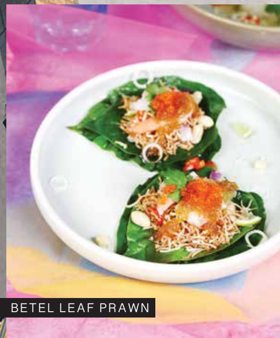
BETEL LEAF PRAWN

Deep fried garlic chive cakes served with chilli in sweet and sour black soy sauce on the side