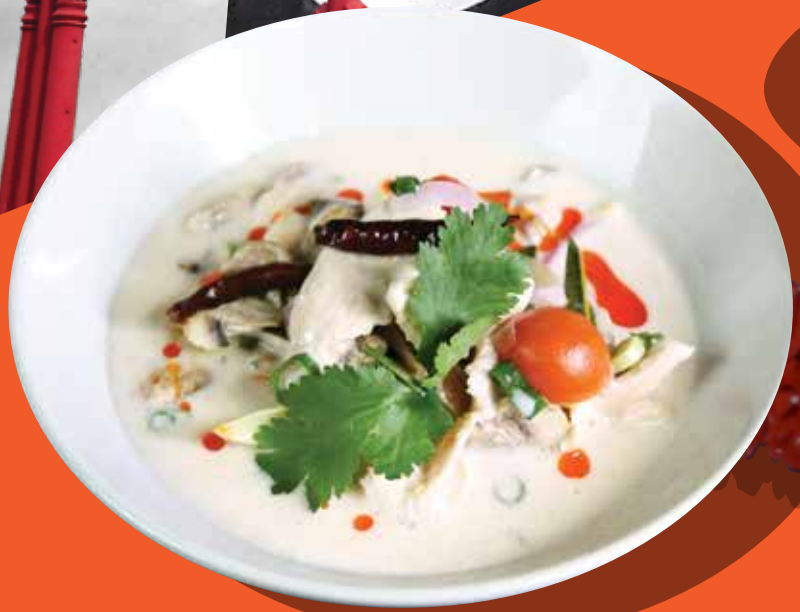
TOM KHA GAI