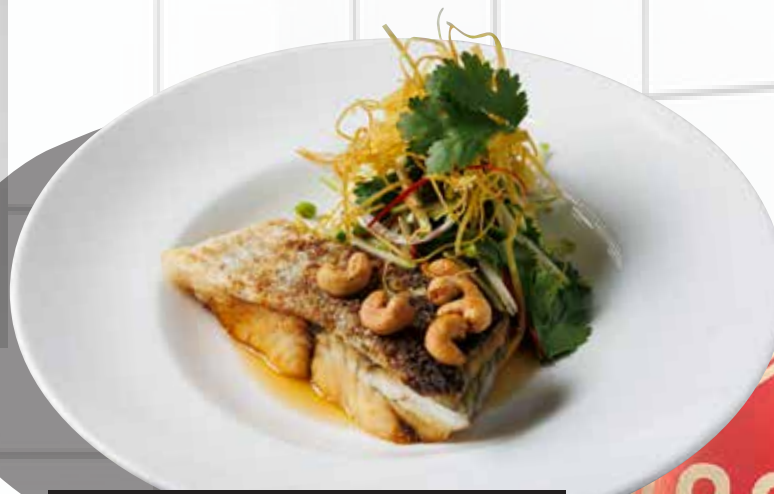
BARRAMUNDI WITH GREEN MANGO OR GREEN APPLE