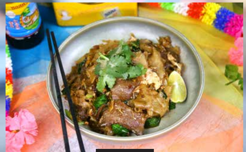
PAD SE EW