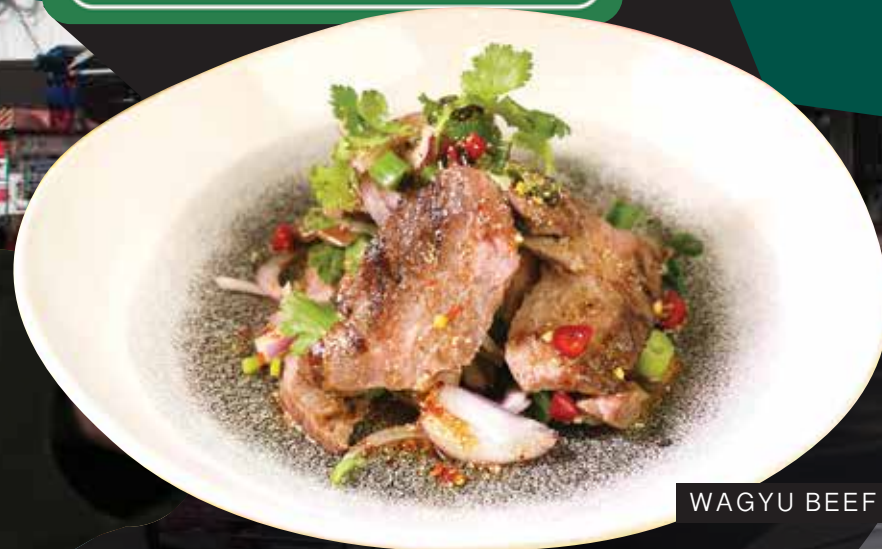
WAGYU BEEF SALAD