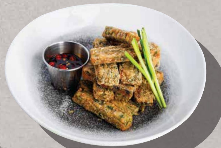
GARLIC CHIVE CAKES