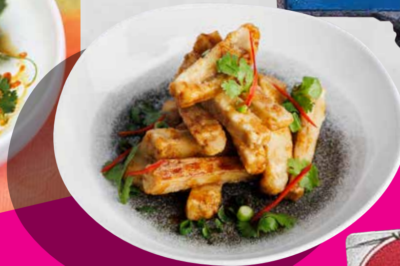
CRISPY EGGPLANT STICKS