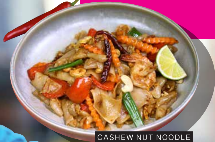
CASHEW NUT NOODLE