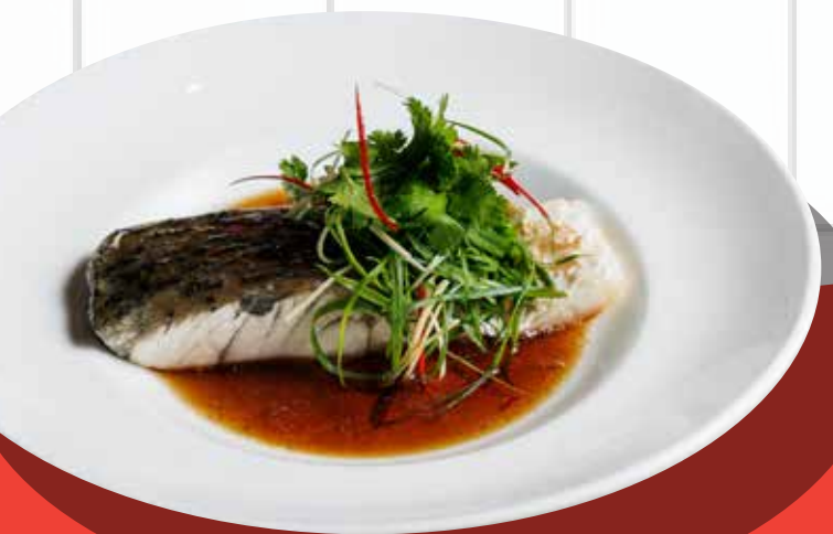
STEAMED BARRAMUNDI FILLET