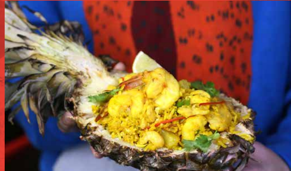
PINEAPPLE FRIED RICE 26.9

Green papaya salad with soft shell crab, peanuts and chilli