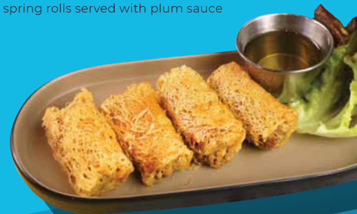
CRAB & PRAWN ROLLS