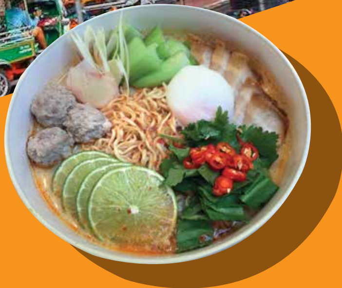
TOM YUM MAMA 25.9 With chicken mince balls, crispy pork and soft egg