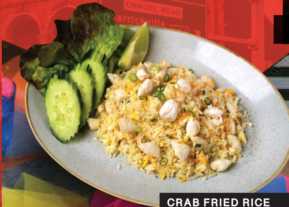
CRAB FRIED RICE 27.9

Fried rice with chicken, prawn, peas, cashew nut and pineapple