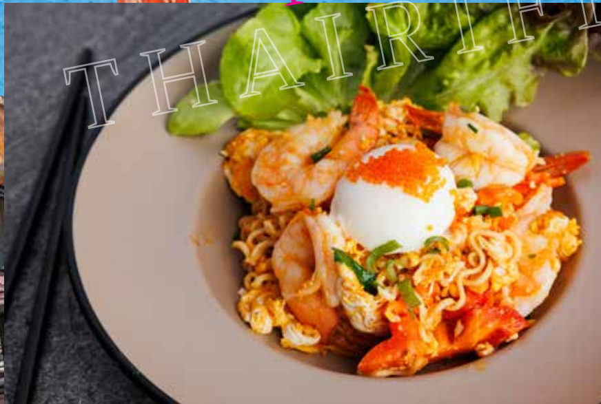
SALTED EGG MAMA 25.9 Noodle stir fried with salted egg and seafood topped with soft egg and Tobiko