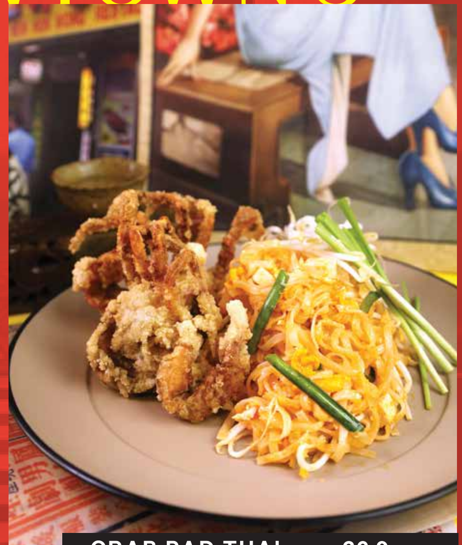
CRAB PAD THAI 26.9

Old school style of Thai Riffic Pad Thai served with soft shell crab