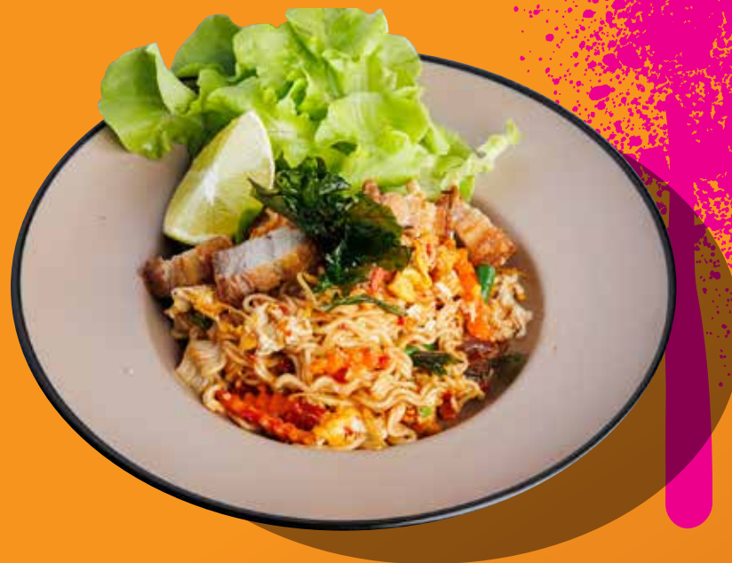
DRUNKEN MAMA 25.9 Stir fried Mama noodles with crispy pork, mixed herbs and spicy sauce