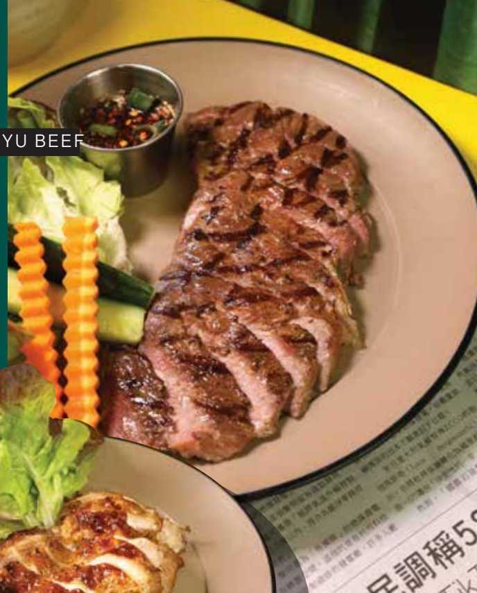
BBQ WAGYU BEEF

North Eastern Thai style grilled wagyu beef mixed with Thai herbs and chilli