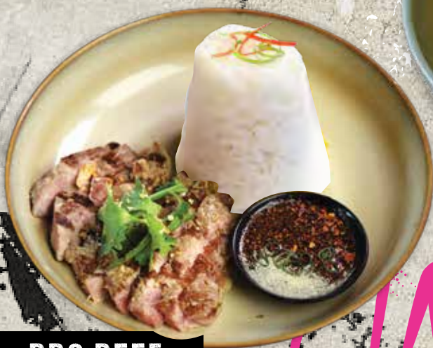
BBQ BEEF WITH RICE 21.9

Original Thai Riffic's recipe five - spice duck, with egg noodles