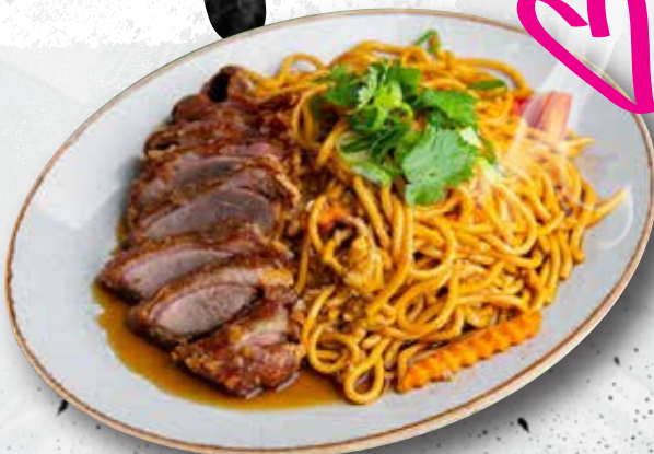
HOKKIEN NOODLE WITH CRISPY DUCK 25.9