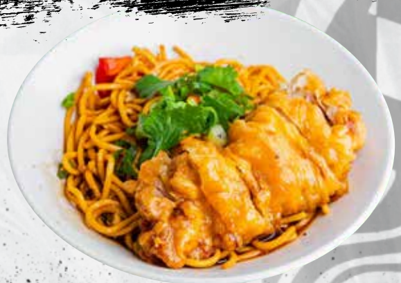
HOKKIEN NOODLE WITH CRISPY CHICKEN 23.9