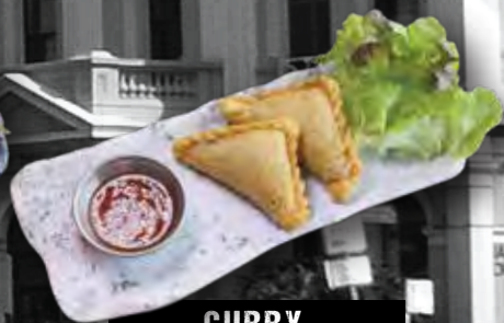
CURRY PUFFS (2)