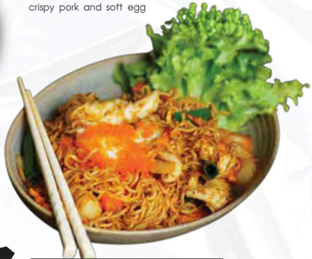
MAMA PAD KAIKEMM 26.9

Stir fried mama noodle with crispy pork mixed herbs and spicy sauce.