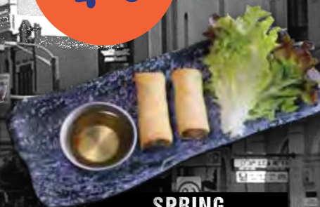
SPRING ROLLS (2)