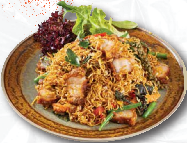
DRUNKEN MAMA 26.9

with Chicken mince balls, crispy pork and soft egg