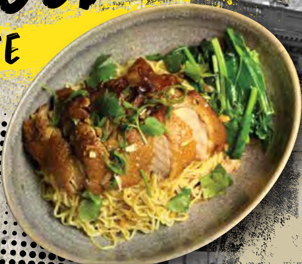
FIVE SPICE DUCK EGG NOODLE 21.9

Original Thai Riffic recipe five-spice duck, serve with rice, steamed Chinese broccoli and chilli vinegar sauce