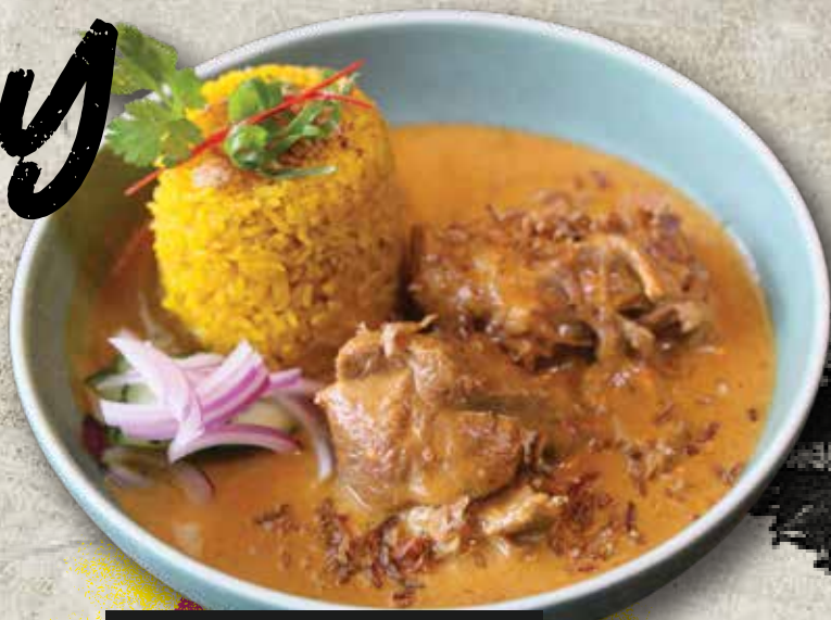
MASSAMUN BEEF € 20.9