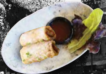
CRAB PRAWN ROLLS (2)