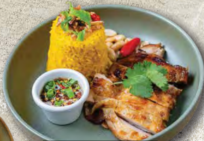
BBQ CHICKEN WITH RICE 19.9

Grilled wagyu beef serve with rice, and tamarind sauce