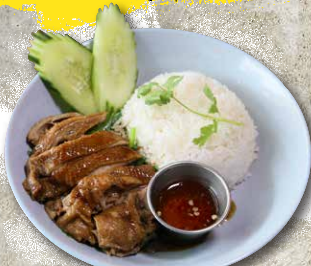
FIVE SPICE DUCK WITH RICE 21.9