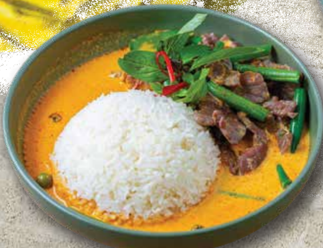
RED CURRY BEEF € 20.9

Classic Thai coconut curry flavored with green chilli paste and Thai herbs, chicken, kaffir lime and basil