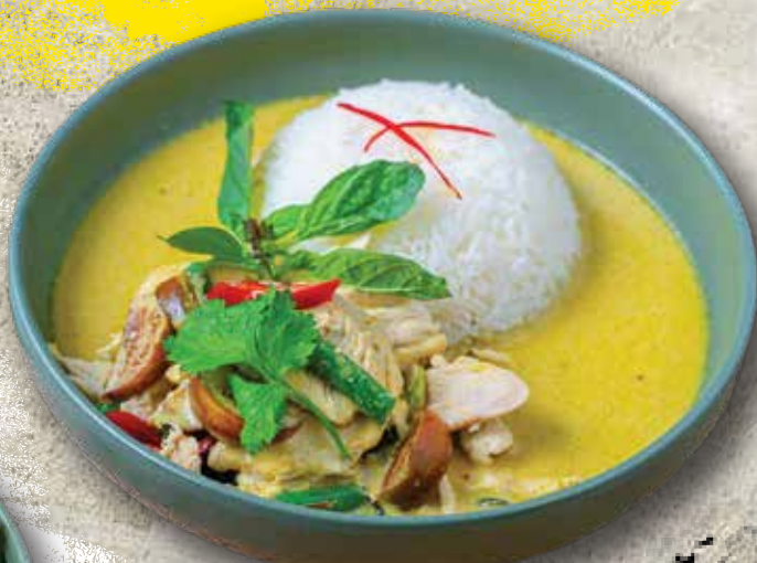
GREEN CURRY CHICKEN € 18.9

Renowned mild Thai curry with slow cooked beef served with turmeric rice