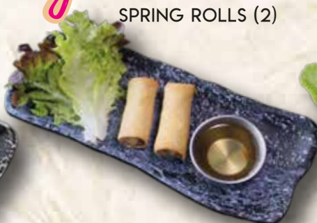
SPRING ROLLS (2)