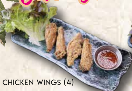
CHICKEN WINGS (4)