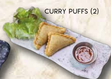
CURRY PUFFS (2)